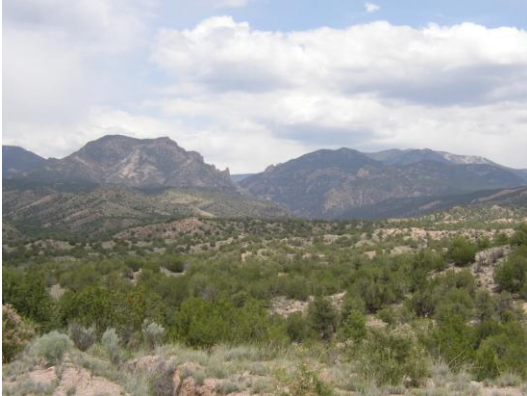
View toward the Gila Wilderness

In order to determine how best to allocate our resources, as part of the strategic planning process, we developed an initial land conservation strategy based upon existing analyses done by The Nature Conservancy, The Wildlands Project, American Farmland Trust, Natural Resources Conservation Service and others; information gathered from the strategic planning interviews; our own knowledge of the state the work being done by other organizations.