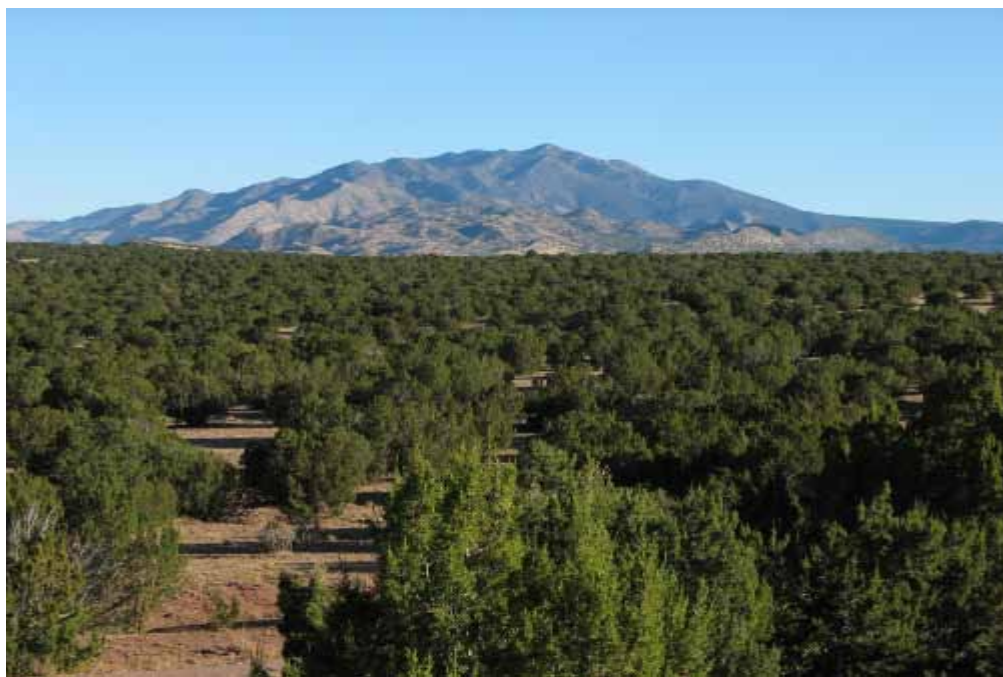
Deer Canyon Preserve