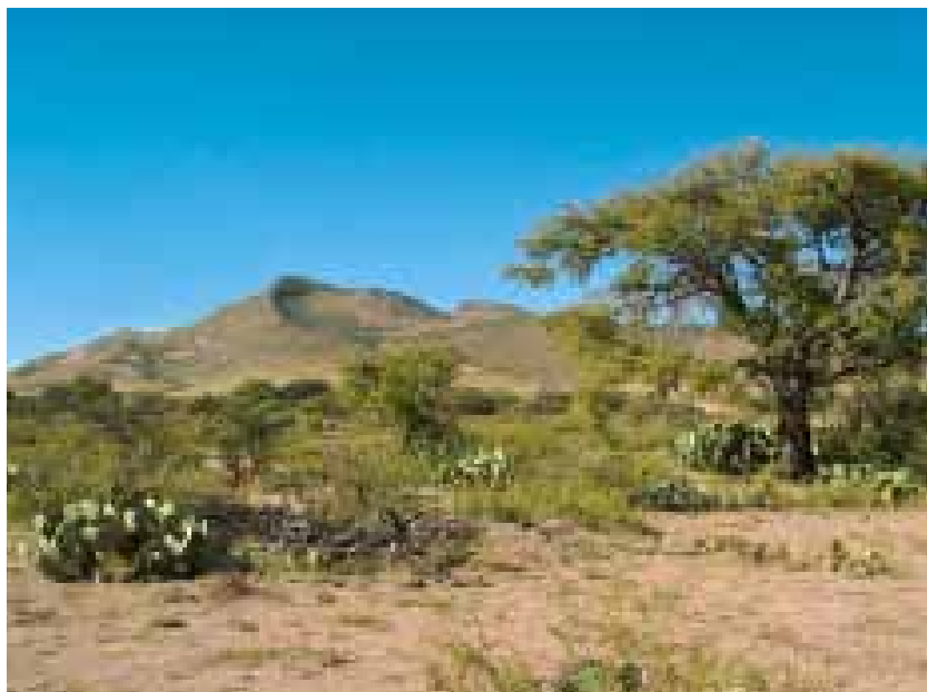
Berrenda Creek Ranch

He says that ranching involves more than the immediate concerns of caring for livestock and trying to make a profit. “A rancher needs to understand he’s in both the livestock business and the land business. You have a responsibility to manage the land and take care of it for future generations.” ❖