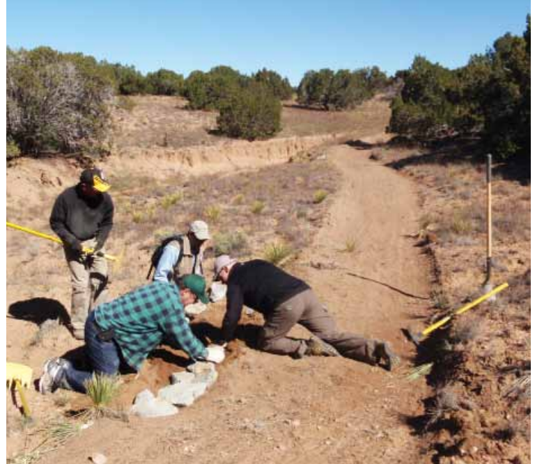
Trailbuilders work to control erosion along the trail