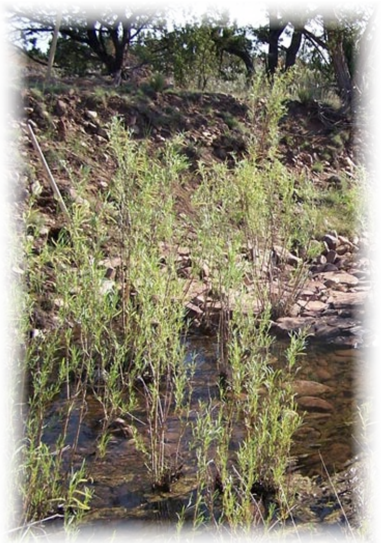
Mesteño Draw Ranch photos courtesy of Tamara Gadzia

http://www.weathershack.com/taylor-precision/2702n.html